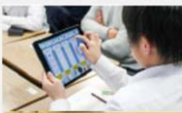
STEM education program with Salesforce.com