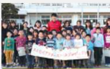
SUMISEI After-school Project with SUMITOMO LIFE INSURANCE COMPANY

Our organization relies on support from partners to drive and work. Based on thoughtful conversation with your organization, we'll develop a customized collaboration program for children.