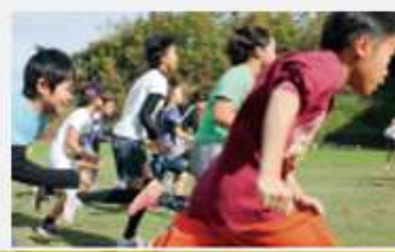
NB sports program with New Balance, Inc.