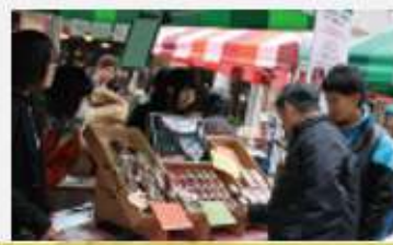
Entrepreneur program in Tohoku, Sports program for disabled children with BARCLAYS Japan